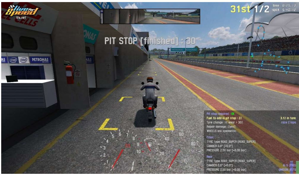
It got stuck in pit stop and switched off its engine.

Unfortunately, these two updates don't apply to Al drivers. I tested it with 32 Al drivers having different bikes. That first issue happened to Al driver using bike "SMISON_B51S". Here's a screenshot: