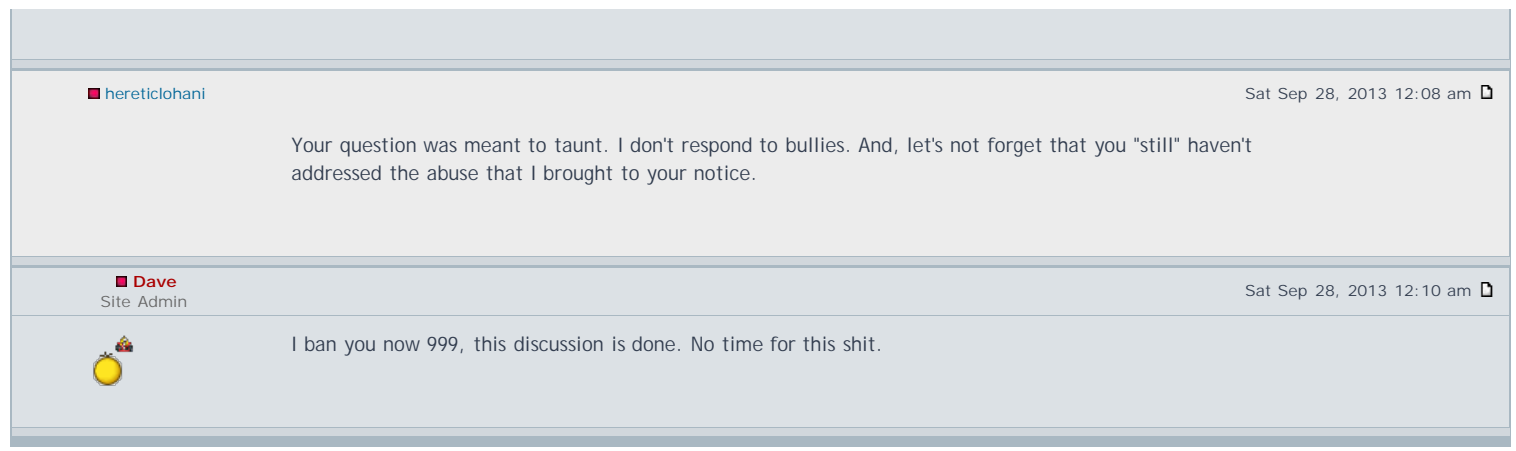
Page 1 of 1 [ 12 posts ]

Board index » Live for speed » Talk of the day